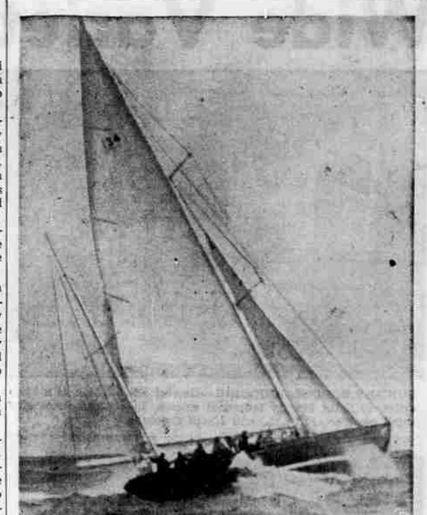
CLIPPING 84 MINUTES from old record of 71 hours 35 minutes and 43 seconds, Swedish yawl Bolero wins 635 mile Newport, R. I. to Bermuda race.

Convenient Terms — $1.25 per week buys two tires! MORE PEOPLE RIDE ON GOODYEAR TIRES THAN ON ANY OTHER KIND