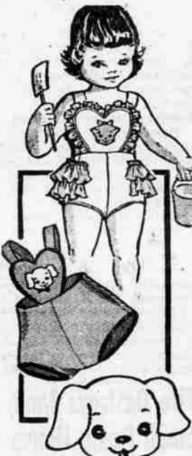
7246 by Alice Brooks

These cool, cute sunsuits are perfect for play—and very easy to sew! Use scraps of contrasting color for the gay applique trim.