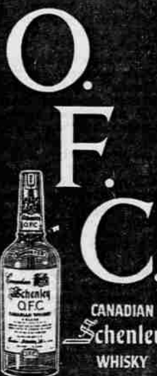
6 YEARS OLD IMPORTED CANADIAN WHISKY, A BLEND, 6 YEARS OLD. NO. 1 PROOF. SCHENLEY DISTILLERS CO., N. Y. & C.