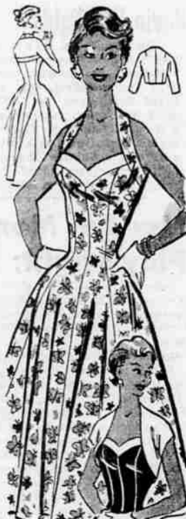
9023 12-20 by Marian Martin

Oh, the wonderful flattery of a "princess" dress! This halter-neck style does the most beautiful things for your figure—fitted and flaring lines—divine! Add to this, the very perfect cover—a dream of a little bolero!