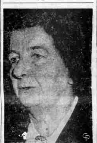
REPLACING Moshe Sharett, Mrs. Golda Myerson becomes new Israeli foreign minister. (International)