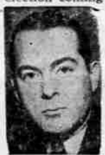
Lyle C. Wilson

By LYLE C. WILSON United Press Correspondent Washington — (U.P.) Some angles the voters should consider with a national election coming up are these: