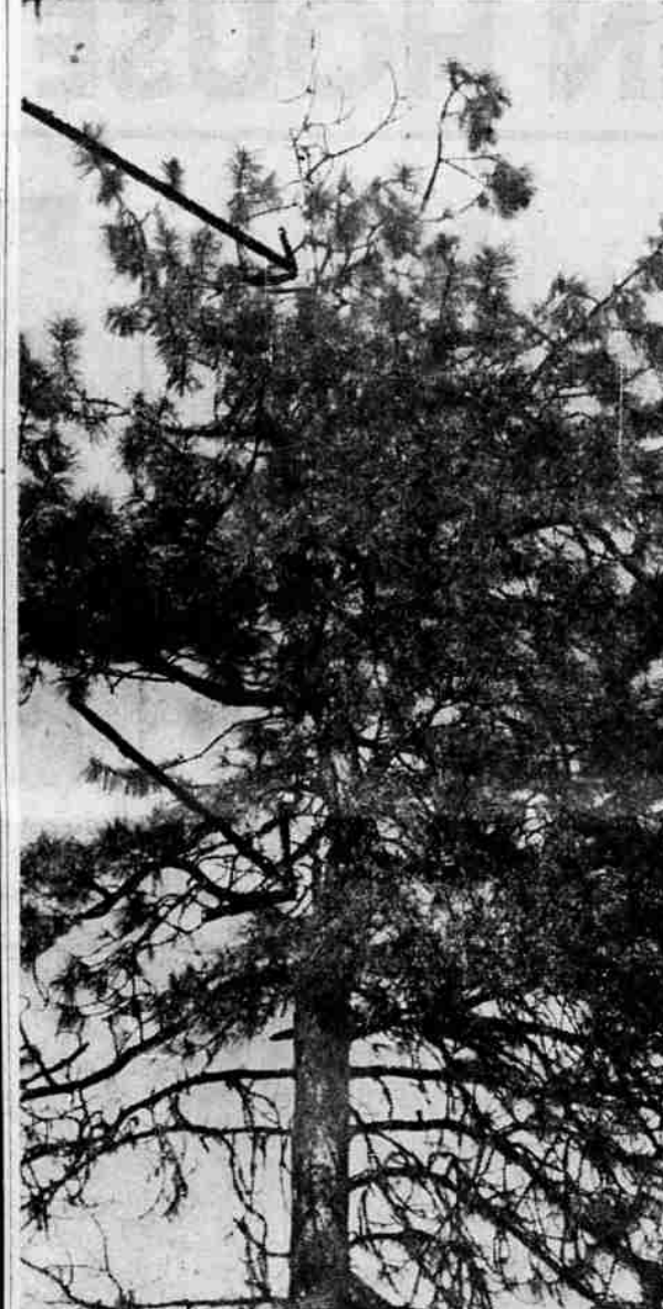
WHY —The "why" of the anti-porcupine campaign is shown above—a ponderosa pine typical of thousands in the woods which are damaged and made virtually useless for lumber purposes. When a porcupine "girdles" a tree with his sharp teeth, the portion of the tree above the girdle dies (see top arrow in picture, where the top of the tree has died). When this happens, the branches nearest the girdle assume the growth characteristics of the former trunk, resulting either in a split tree, or, as shown above (see lower arrow) a deformity. Trees such as this and the many others with similar deformed trunks do not make good lumber, and many of them are not usable at all, simply "taking up growing space" according to forestry experts.