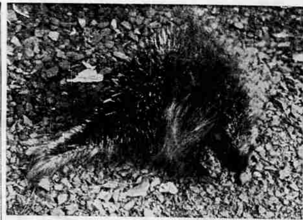
WHO —The "who" in the campaign to cut down the porcupine population of Jackson county is shown above—old Erethizon dorsatus dorsatus himself. Jackson county is starting to pay a $1 bounty for porcupine noses for the first time this year, and plans are under way for a contest among young people with prizes for those bringing in the most salt-cured noses. Details of the contest will be announced shortly.

The smell of the animal is not like that of the skunk, which is a system of defense and can be "squirted" at a molester. It is a natural characteristic, and is most unpleasant at close quarters after the porcupine has been killed. Porcupines are also frequent-