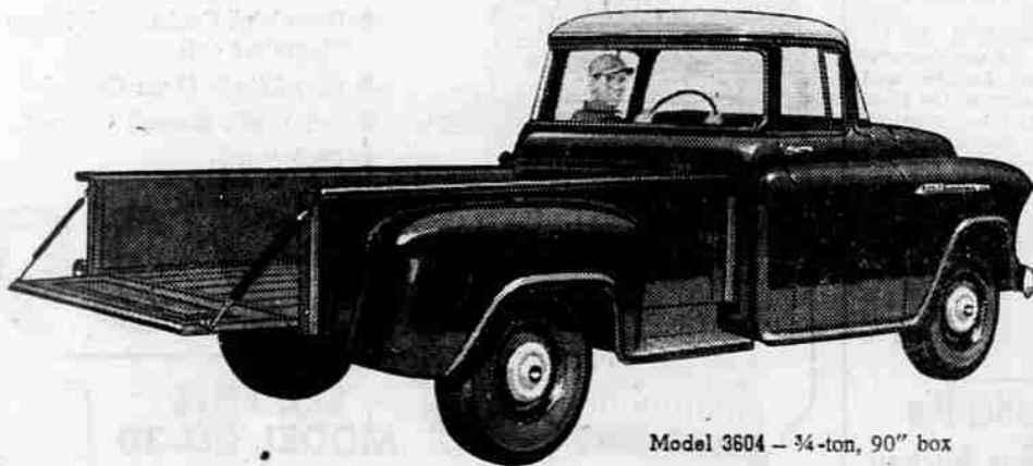
Model 3604 — ¾-ton, 90" box