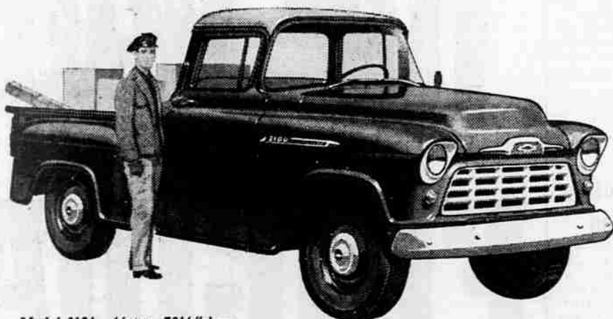
Model 3104 — ½-ton, 78½" box