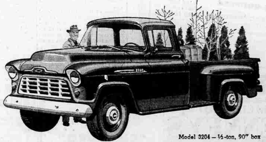
Model 3204 — ½-ton, 90" box