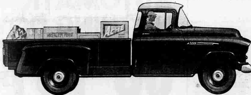
Model 3804 — 1-ton, 108½" box