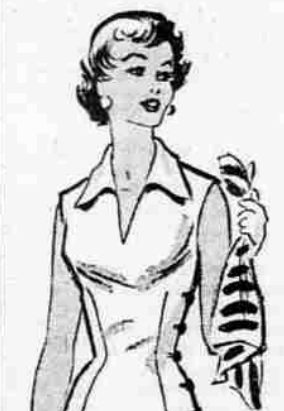
9276 by Marian Martin

The long lines of Paris are lovely indeed—translate this 2-piece outfit into the HIT of the season! Smoothly molded bodice, tiny waist, slim skirt—flattery for any figure! Sew it in crisp linen, colorful checked cotton. Wear it—and love it for every occasion!