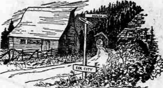
Within environs of Elk City, quiet hamlet on the Yaquina, are two covered bridges, this one on road to town from Corvallis.

Mills Work Busily Shingle mills and sawmills, cutting short-length boards, work busily along the Yaquina almost as far inland as Elk City, about 20 miles up from the coast. The Yaquina, a wide bay inside the bar, gradually narrows as you go upstream. On the right bank, a gravelled road leads part way to the ocean, but on the left, the road runs out to U. S. highway 101 at Newport. On the left, above Toledo, a spur of the Southern Pacific railroad crosses the mountains from Corvallis and hauls logs to the mills and chip waste from the mills to be converted into paper in Oregon City. This waste was formerly sawed into slawood and sold to families for burning. Train passenger service was discontinued years ago. The few