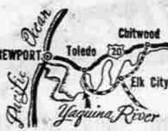
Communities along course of Yaquina are located on map.

farm families who still live farther inland along the left bank of the river above Toledo must cross by boat to reach the road. Most of the farmhouse windows have a vacant stare, and they are mossgrown and saggy, while the old orchard trees grow gray with lichens and plead to be pruned. Many ghostly pilings, standing singly or in groups lashed together by rusting cables, give evidence of past activity along the waterside. Below the banks are floating logs, some fastened together with steel straps, some almost submerged, basking in the sun like lazy hippos. It took over an hour to travel from Toledo to the small dock at Elk City, which was built at Toledo and towed upstream to replace the old one when Elk City was a port of call for the steamboats on the river. Elk City, according to Paul Hanson, storekeeper, postmaster and general factotum, is only three miles across the mountains, as the bees fly, from Toledo, but by the curving river it is nine. In this isolated country, the small cluster of buildings is town to the 70 inhabitants, and the grange is the center of social life.