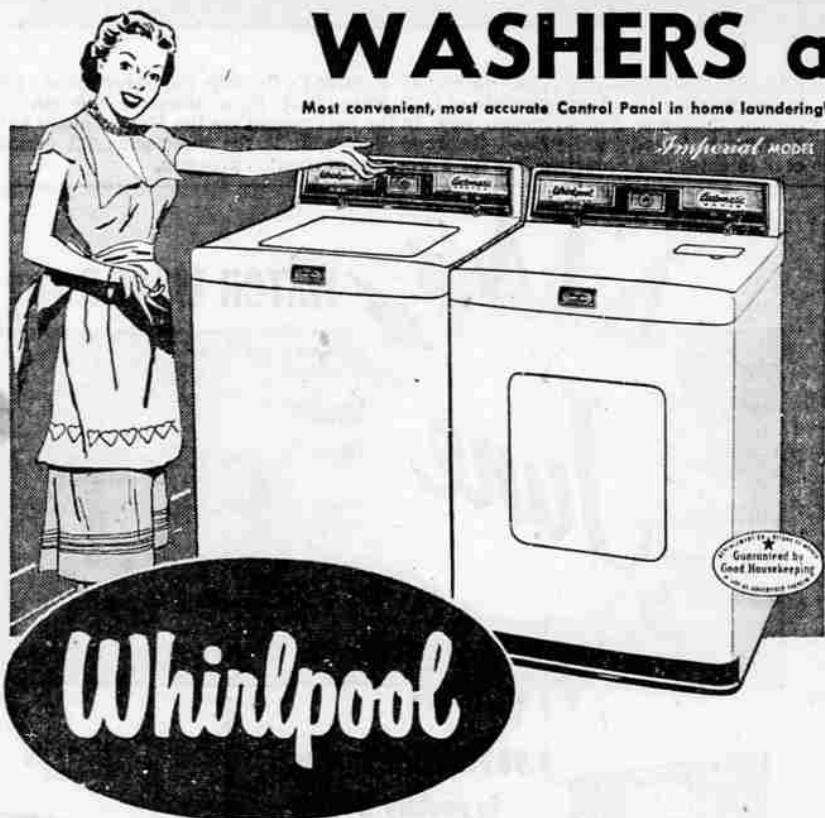
Most convenient, most accurate Control Panel in home laundering!