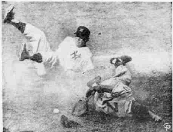
BEATING PEG TO FIRST, Yankee Mickey Mantle collides heavily with Kansas City's Vic Power. Mantle took third strike pitch and outran peg after Catcher Thompson dropped the ball.