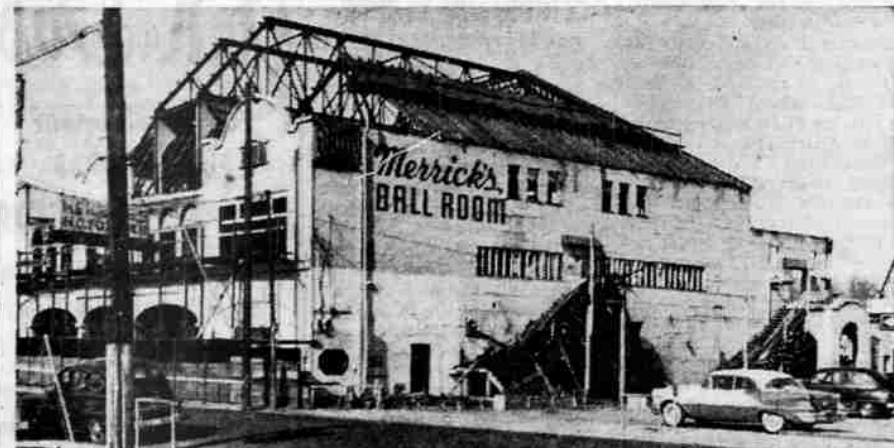
GOING, GOING... — Merrick's building—also known over the years as the "Natorium" or "Nat," and also the ballroom—one of Medford's landmarks, virtually vanished last week, as wrecking crews neared completion of the demolition job. The picture at the left shows how the building appeared just as the tearing-down job was started several weeks ago. The view at the right shows how it appeared last week, with only a few girders and one or two smaller walls and archways remaining.