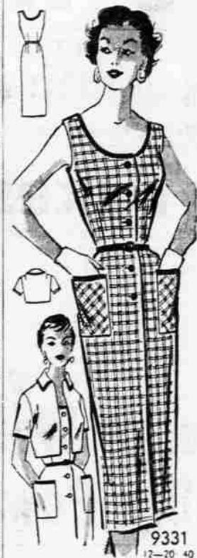
9331 by Marian Martin

Fashion classic—beautifully adapted to summer's sizzling weather! You'll stay neat, cool, smart—everywhere you go in this slim ensemble. Step-in sundress—no overhead muss or fuss; its simple lines a cinch to launder. Little bolero for pretty cover-up!