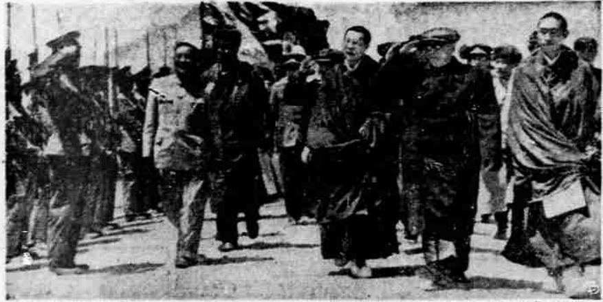
VISITING TIBET in connection with program to bring that Asiatic land into Communist framework, Chen Yi Red China's vice premier (saluting, second from right), reviews Tibetan troops. Dalai Lama, Tibet's spiritual leader at Chen Yi's left and Panchen Lama (far right), head Communist committee.

Portland—Wholesale hay prices: New crop No. 2 green alfalfa, baled, 10.5; Portland nominally $25-26, some sales higher. New crop prices not established.