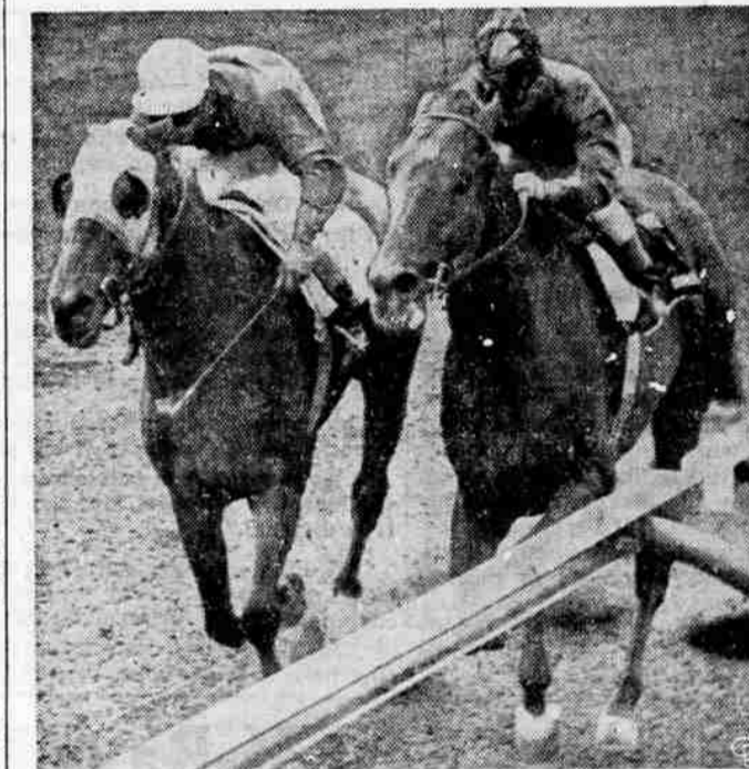
COMING FROM BEHIND, Porterhouse (outside) beats mighty Swaps in California feature race at Hollywood Park. Time was 1 minute 40.8 seconds.

Going camping this summer? Get some good tips from books at your Medford Public Library.