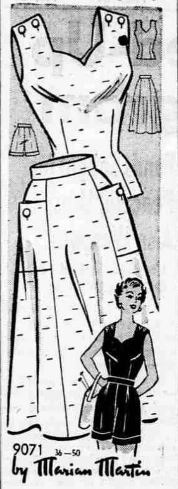
9071 by Marian Martin

Wonderful styles for sun and fun—designed to fit, flatter the larger figure! Sports-top, skirt, classic shorts—mix and match fabrics, colors for many smart fashion changes all summer! Easy sewing—make them right away!