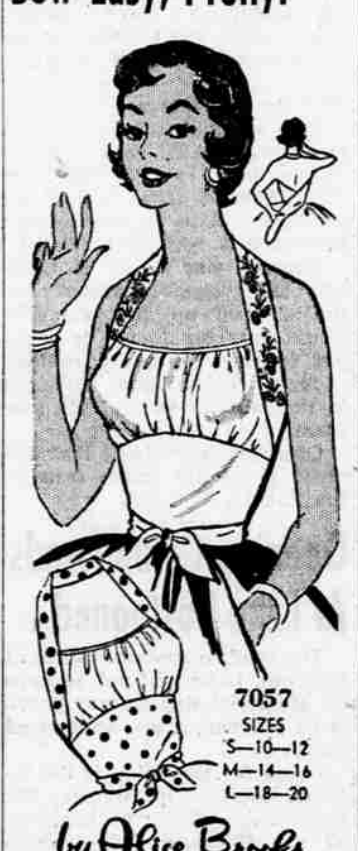
7057 by Alice Brooks

EASY! Little fabric, sewing time to make this cool halter! Wraps and ties, opens flat to iron. Easy, pretty embroidery too!