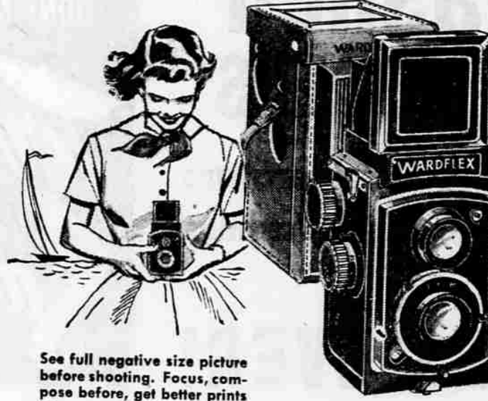
See full negative size picture before shooting. Focus, compose before, get better prints later—save on film.

See what you shoot! Matched f/3.5 lenses. Built-in magnifier for sharpest focusing. Coated anastigmat lens focuses from 3 1/2-ft. 8 shutter speeds, 1 to 1/200 sec. plus bulb. Flash synchron. to 1/100 with SM, SF bulbs. Take 12 pictures 2 1/4 x 2 1/4 in., roll or 120 film. All-metal body with leather-like covering.