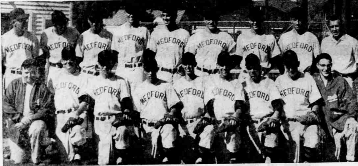
5 A-1 CHAMPS VIE AT EUGENE—The Medford high baseball team, above, District 6 A-1 titlist, goes to Eugene on Friday to battle the Eugene high Axemen in a state quarter-finals play-off game. Medford took the district and Southern Oregon Conference diadems with a nine-win three-loss record, winning its last seven straight league games, including two each from Grants Pass and Klamath Falls last week. Left