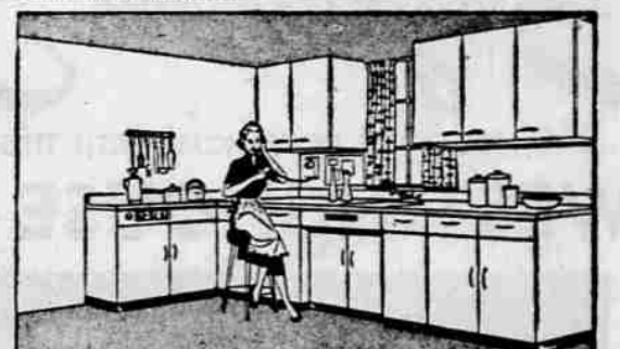
And as budget permits add several wall and more base units...