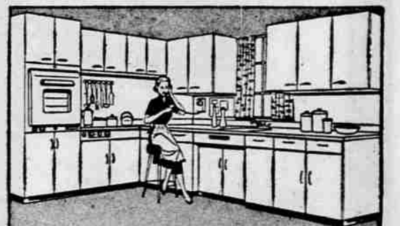
Still later, install built-ins and more wall cabinets to create a beautiful kitchen tailored to your needs as they develop.