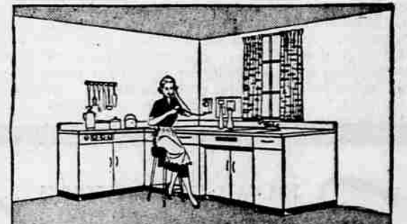
You can start your personalized kitchen with just a sink unit and one or two base cabinets...