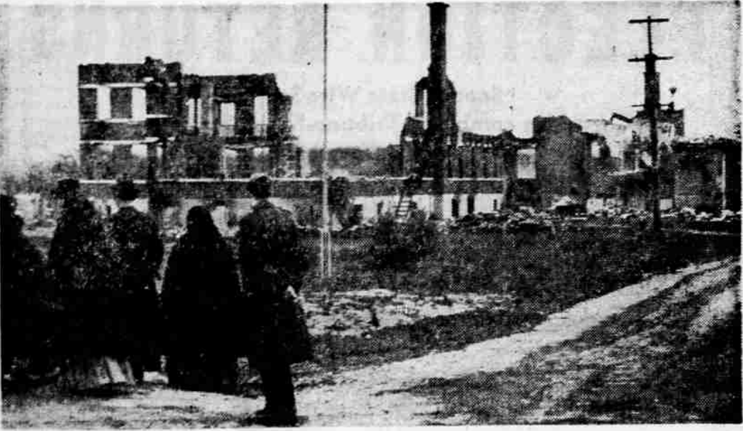
CRASH KILLS 15 NUNS —A group of nuns and a priest view the charred ruins of a Roman Catholic home for aged nuns in Ottawa, Ontario, the morning after a rocket-laden RCAF twin-jet, flying an interception mission, hurtled into the building. The plane's bursting rockets turned the place into an instant funeral pyre for 15 nuns, a priest, a cook and the two-man crew of the CF-100. The explosion and screams of the nuns brought neighbors on the run who rescued 17 nuns.