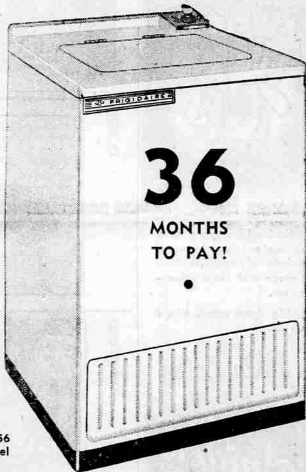
WS 56 Model