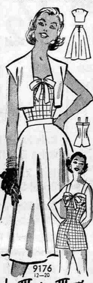
9176 12-20 by Marian Martin

You'll live in, love these smart summer fashions—they're wonderful separates for travel, vacation! Wear the one-piece play-suit for fun-time, add the skirt to make a pretty sundress, the little bolero for cool cover-up! Pattern 9176; Misses' Sizes 12, 14, 16, 18, 20. Size 16 ensemble, takes 1 3/4 yards 35-inch checked fabric; 4 1/2 yards 35-inch plain. This easy-to-use pattern gives perfect fit. Complete, illustrated