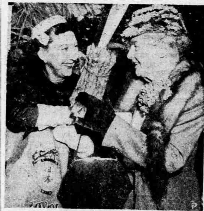
OPENING WASHINGTON Cathedral Annual Flower Mart, Mrs. Dwight Eisenhower buys some asparagus from Mrs. Woodrow Wilson, widow of President Wilson