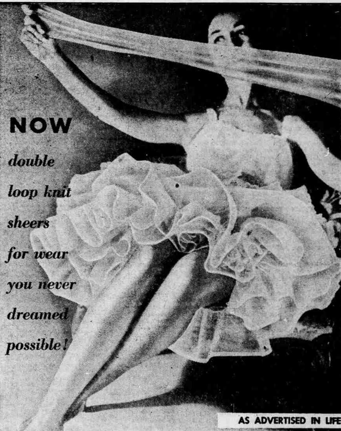
AS ADVERTISED IN LIFE

NOW double loop knit sheers for wear you never dreamed possible!