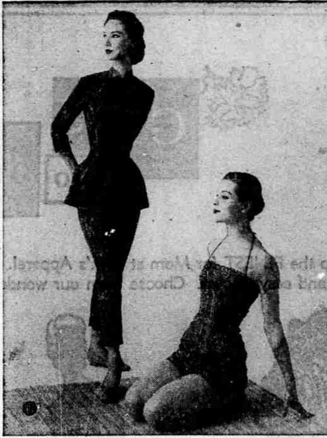
For a Far Eastern-styled sun wardrobe, Cabana creates a group of playclothes in a Persian printed cotton. Left: A slim, fitted Rajah jacket tops pants tapered to a neat ankle. Right: The most feminine one-piece swim suit to hit the beaches in years cuts a new figure with frog side-closings.

Use the blower attachment of a vacuum cleaner to dry the inside of wet boots.