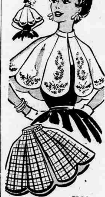
7156 by Alice Brooks

Graceful cape has your favorite 8-gore flare—so flattering to every figure! Make two versions—in print or check; in sparkling white, trimmed with embroidery!