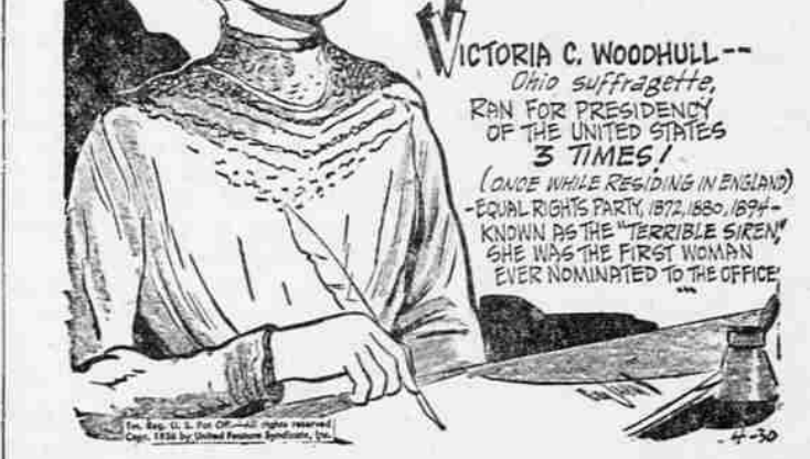
VICTORIA C. WOODHULL—Ohio suffragette, ran for presidency of the United States 3 TIMES! (ONCE WHILE RESIDING IN ENGLAND)—EQUAL RIGHTS PARTY, 1872, 1880, 1894—KNOWN AS THE "TERRIBLE SIBREN" SHE WAS THE FIRST WOMAN EVER NOMINATED TO THE OFFICE