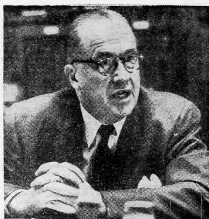
TESTIFIES—Agriculture Secy. Ezra Taft Benson (above), appearing before Senate appropriations subcommittee in Washington, said that failure to approve a "sound" soil bank plan might lead to further cuts in farm price support levels next year. The hearing was on his department's budget for next fiscal year.

Free: By special arrangement with the editors of the Encyclopedia Americana, my panel of judges will award each week to the reader who sends me the best true-life nature adventure, the best nature observation, or the best question on nature and wildlife, a complete 30-volume set of this world-famous reference work in a handsome Sealcraft binding. Each week new submissions will be considered. Sorry, I simply can't answer your many friendly letters. Please address your letter to: IS THAT SO? c/o Medford Mail Tribune, Box 575, Sausalito, Calif.