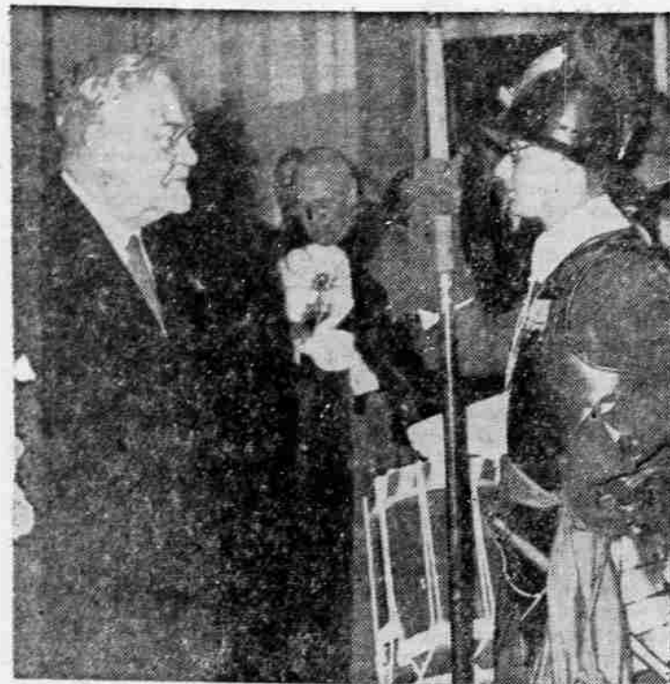
PREMIER PEPUSES PIKEMAN —Soviet Premier Nikolai Bulganin intently studies attire of pikeman at Mansion House, London's city hall, on his arrival for lunch with members of the city council.