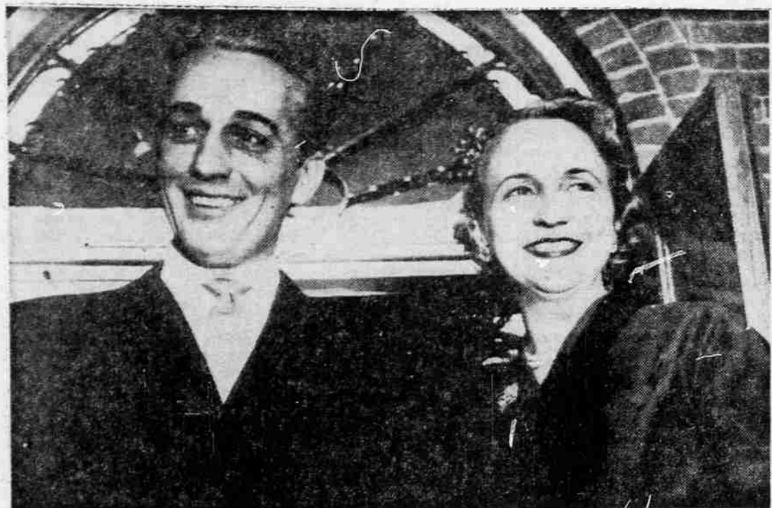
IN BAHAMAS—Margaret Truman Daniel and her husband, Clifton Daniel, were in seclusion in their honeymoon cottage at Nassau today following their marriage in Independence, Mo., Saturday. They are shown above on the steps of the Trinity Episcopal church in Independence.