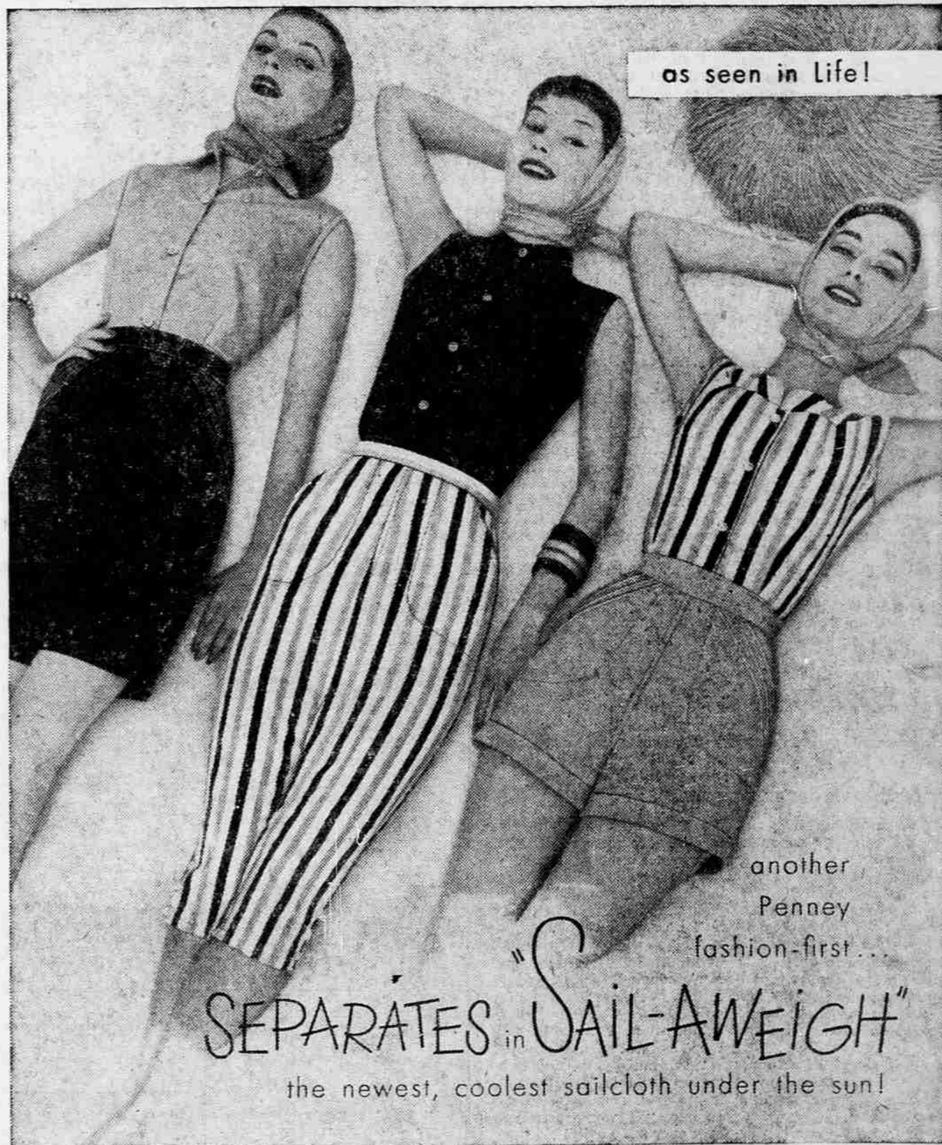
as seen in Life!

The Style Leader For FASHIONABLE SPORTSWEAR