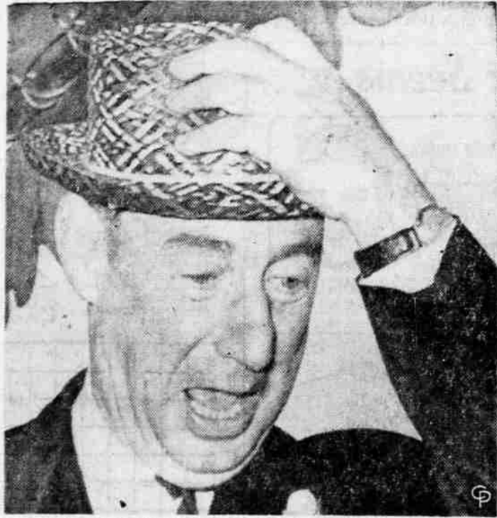
ACCEPTING PASSERBY'S GIFT, Adlai Stevenson tries on straw hat to keep head from getting sunburned while on handshaking tour of Miami in campaign against Senator Estes Kefauver for Florida votes.

Astoria — (U.P.) — Republicans in Clatsop county have maintained a slim lead over Democrats after close of voter registrations this week. The county clerk's office said tabulations completed so far show 6963 registered Republicans and 6720 Democrats, a margin of 245.