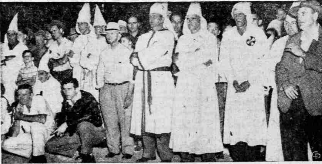
MEETING IN MACON, GA., members of Ku Klux Klan burn fiery crosses, demonstrate against Supreme Court decision outlawing school segregation.