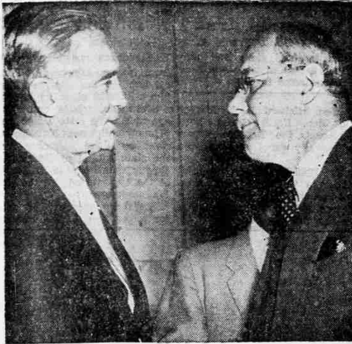
SECRET HEARING —Allen W. Dulles (right) director of Central Intelligence Agency was called before special Armed Forces subcommittee on air power to tell if his agents report Russia has surpassed the U. S. in air power. He is shown conferring with Senator Stuart Svmington (D., Mo.), chairman of the subcommittee, prior to the secret hearing.

POISON OAK? Try a Bottle of ZEMACOL You must be satisfied or your money cheerfully refunded. Get a bottle today at WESTERN THRIFT.