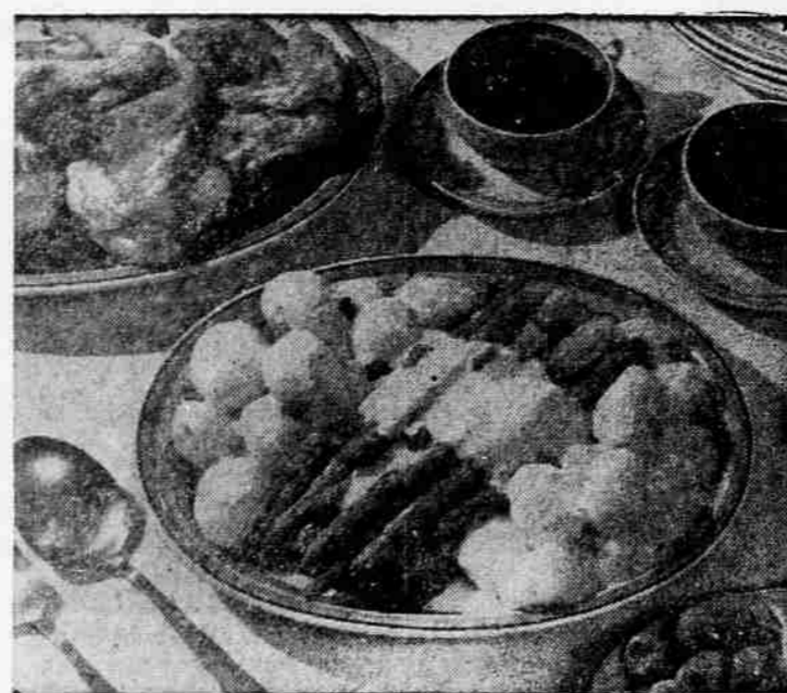
SUPERB EATING —There's superb eating in this marvelous meal that offers bargain-priced broilers or fryers, fresh California asparagus and new potatoes. These and other good recipes for regional, seasonal foods are included in today's food columns.

There was no street address or house number. Only a penciled note: "the mail man knows her." He did, too.