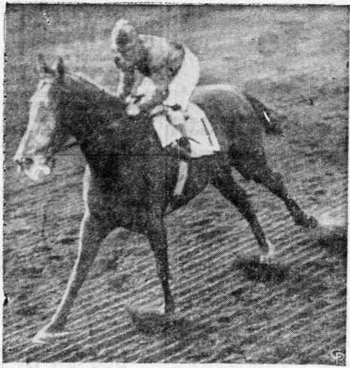
CROSSING FINISH LINE in record-breaking time, California raised Swaps wins race at Gulfstream, Miami, Fla., by three lengths. New world record for mile and 70 yards is one minute and 39.3 seconds.