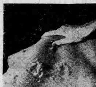
MOTHPROOF. The lovely texture of Wunda Nylon can never be harmed by moths!

Wunda Nylon is made by the Wunda Weve Carpet Company, producers of loom woven cotton and nylon broadloom carpets...at every price...for every budget!