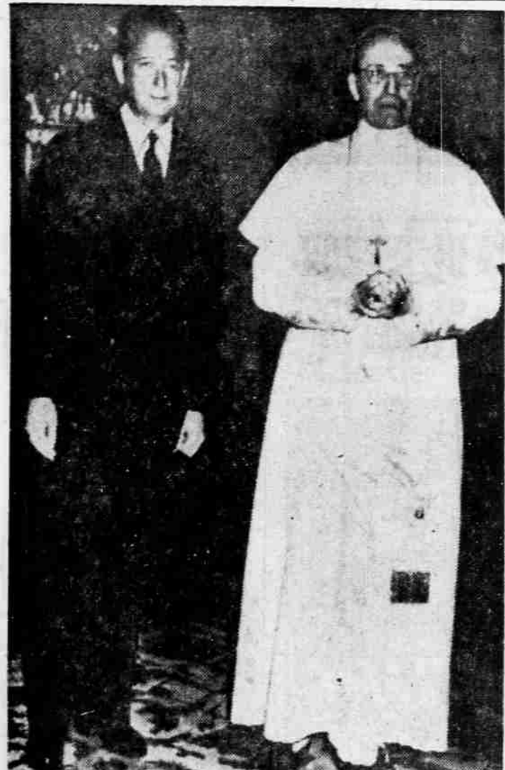
AFTER AUDIENCE —Pope Pius XII and Secretary General of the United Nations Dag Hammarskjöld pose together after their 20-minute talk at the Vatican. The Pope is understood to have given his blessing to the secretary general's peace mission to the Middle East.