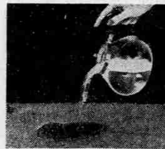
COLORFAST. Not even boiling water can change the color of Wunda Nylon!

Choose your Wunda Nylon Broadloom Carpet from these new decorator colors: $14 95 PER SQUARE YARD Aqua • Muted Beige • Rose Beige • Wedgewood Blue • Charcoal Cinnamon • Coral • Nugget Gold • Almond Green • Sage Green Dove Grey • Regal Red • Turquoise • White