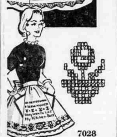
7028 by Alice Brooks

Easy, thrifty! This unusual kitchen apron is made simply from TWO huck towels! Its charming motto and colorful decorations — formed by gay huck-weave motifs!