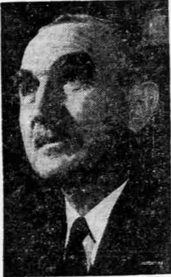
SEN. WAYNE MORSE To introduce Mrs. FDR