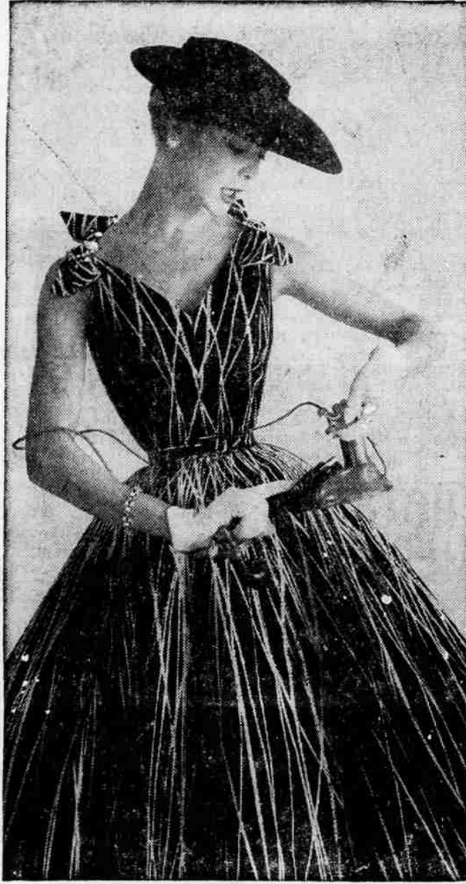
You're divinely ready for your important cocktail dates in Gloria Swanson's lightning streaked cotton print fashioned to your taste, to your figure, to your pocketbook. Glitter buckles at shoulder tops. Voluminous skirt accentuates a tiny waist. Black with white. 10 98