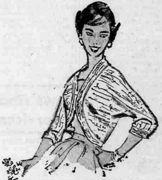
Sweater Shrugs 2 98 to 5 98

Special purchase sale of pique sheaths in ice blue, pink, aqua, and sunflower yellow. Buttons all the way down, sleeveless with roomy front pockets and sport collar. Terrific for town, crisp for shopping, and packable for travel. Sizes 10 to 18. 8 98