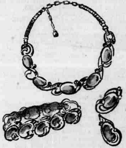
Costume Jewelry Values to 1.98 79 c plus tax

Completely washable orlon coats . . . fashions you can bank on. You can wear these beautiful coats as often as you wish and wash them as often as needed without the extra cost of cleaning. Their cashmere softness and lush texture require no extra care. In addition, orlon is as warm as wool, lighter in weight, moth-proof, wrinkle-proof.