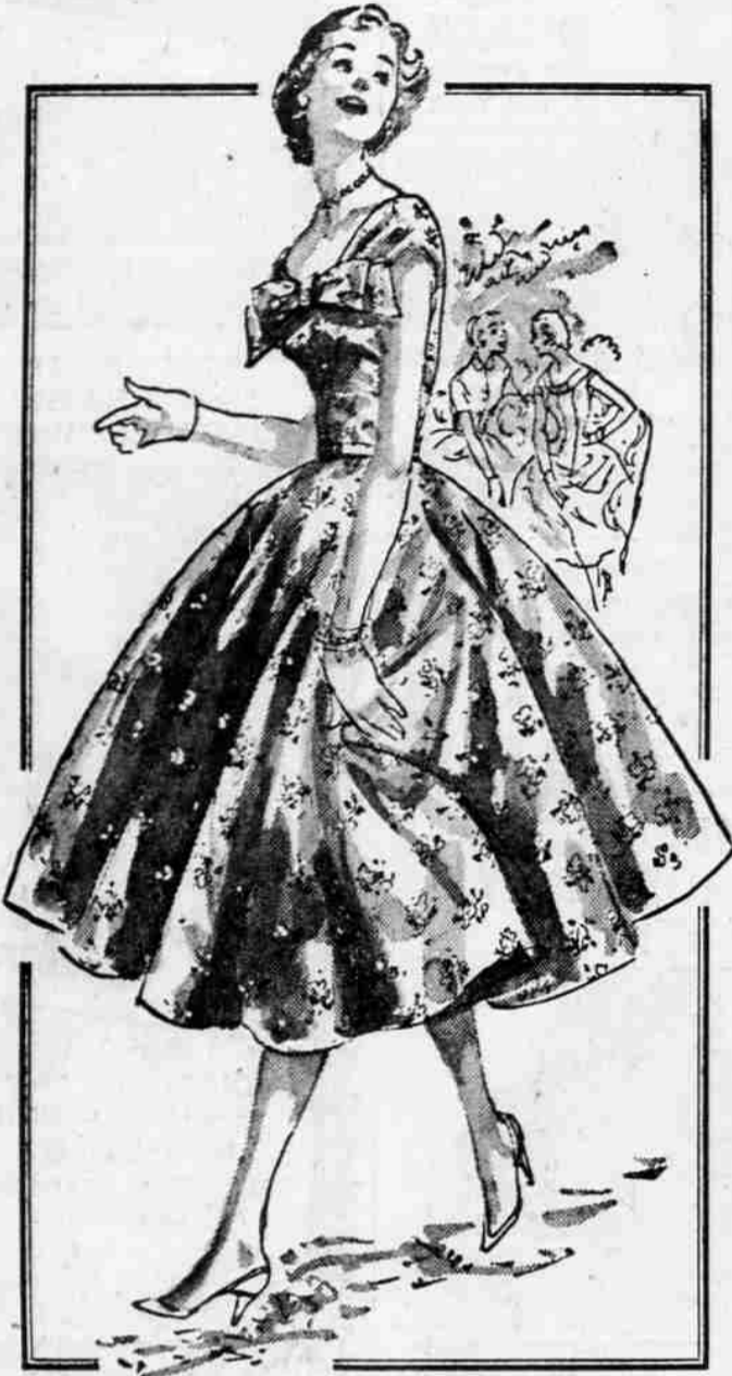
Flair of Miami Cottons priced 9 98

Summer loves for summer-loving misses and juniors . . . beguiling young fashions with a feminine air . . . with tiny waists, sweeping wide skirts. Pretty and polished for on-the-town wear in shock-color tones, always correct . . . sweetly-demure prints. All styled by Flair of Miami at a budget price.