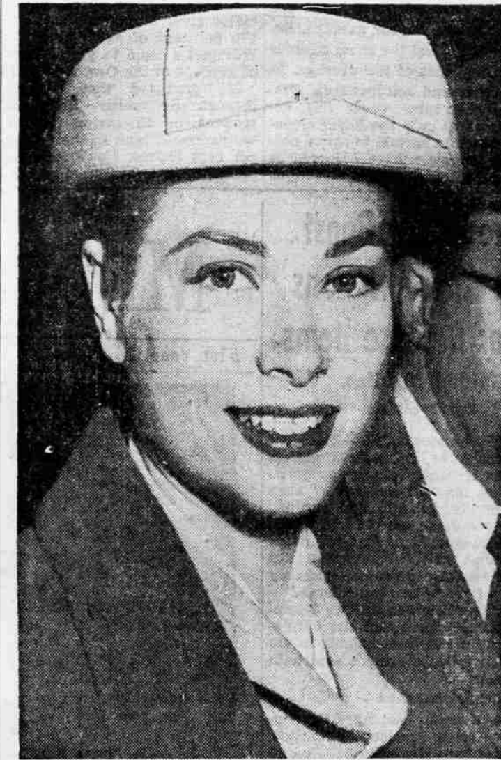
A PICTURE PRINCESS—Actress Grace Kelly flashes a dignified smile as she boards the liner SS Constitution in New York for her voyage to Monaco to become the bride of Prince Rainier.

One fact helping the critics along is the inability—if that is the word—of Europe's crowned heads to attend this marriage. Taking their cue from these leaders, any number of notables will not be among those in the principality for the ceremonies.