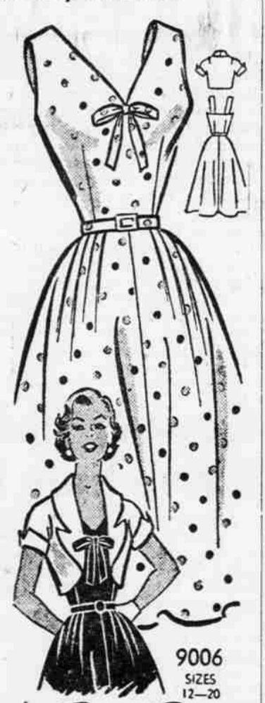
9006 SIZES 12-20 by Marian Martin

Lovely new ensemble to see you smartly through the warm months of summer! Perfect dress for sunning—with cool, airy top; soft pleats to detail the graceful skirt. Little bolero adds the cover-up for city-going occasions (dapsels in a pretty, new shape).