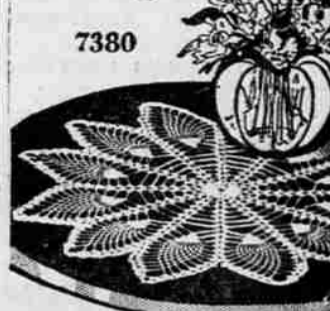
7380 by Alice Brooks

Beginner—simple to make this doily for your own home; for a pretty gift! All in pineapple pattern—your favorite crochet!