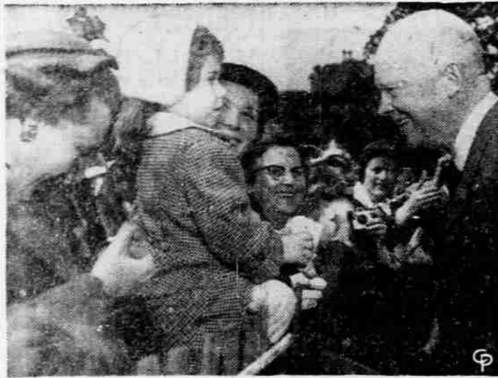
GREETING CHILDREN who gather on White House lawn for annual Easter Monday egg roll, President Eisenhower chats with awed youngster who hopes to fill basket with gaily colored goodies.

Minneapolis—(U.P.)—Like police everywhere, Minneapolis officers are used to strange reports and questions, but they were stumped by this one. "Is this the place where you cash bad checks?" the caller asked.