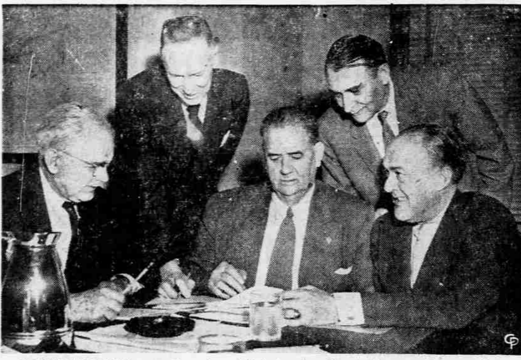
HOPING TO WIND up work on farm bill in few days, Senate-House conferees continue meetings in Washington. From left, Sen. Spessard Holland, (D), Fla.; Rep. E. C. Gathings, (D), Ark.; Sen. Olin Johnson, (D), S. C.; acting chairman of joint group, Rep. Lifford Hope, (R), Kan.; and Rep Harold Cooley, (D), N. C.