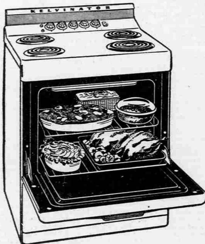
KRF32 36-INCH RANGE