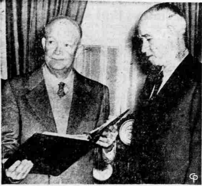
REPORTING TO President, Gen. Omar N. Bradley (right), chairman of President's Commission on Veterans' Pension, presents commission's study of laws and policies pertaining to pension, compensation, and related non-medical benefits for veterans and their dependents.