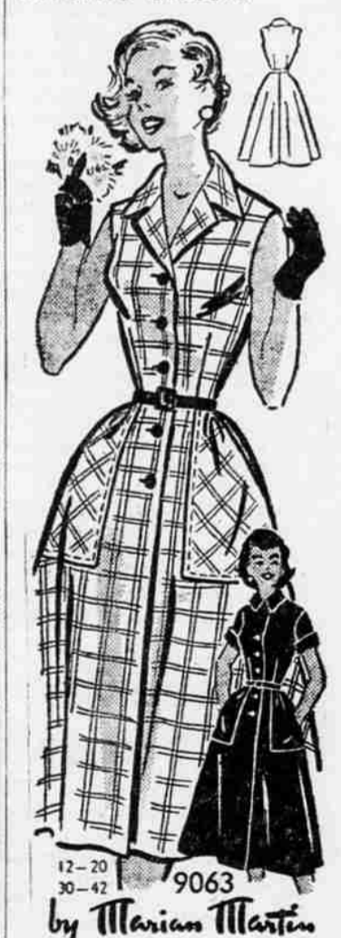
12-20 9063 30-42 by Marian Martin

Easy-flowing lines of the shirt-waist dress—spell flattery any season of the year! You'll jiffy-sew this cool summer version in sleeveless step-in style; with convertible neckline, handsome pockets. Use the pattern again come fall—add short, 3/4 sleeves! Pattern 9063: Misses' sizes 12, 14, 16, 18, 20, 30, 32, 34, 36, 38, 40, 42. Size 16 takes 5 1/2 yards 35-inch.