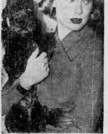
BUSY packing for voyage to Monaco where she will wed Prince Rainier, actress Grace Kelly takes time to air Oiler, her poodle, outside New York home.

The Grange cooperative was entered through a rear window and a few tools were reported stolen, deputies reported. At the lumber company $200 was reported taken from the safe.