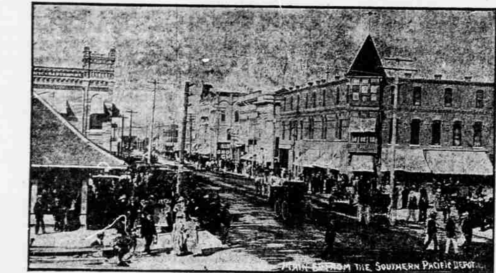
THE WAY IT WAS —The Robinson hotel, then known as the Nash, had only two stories in 1910 when this picture was taken. At the top of the building was a prospectors pick and gold pan mounted as a weather vane. This weather vane was removed several years ago when it became badly ruined. A third story had been added to the building and countless other changes have taken place. This is Medford's oldest hotel.