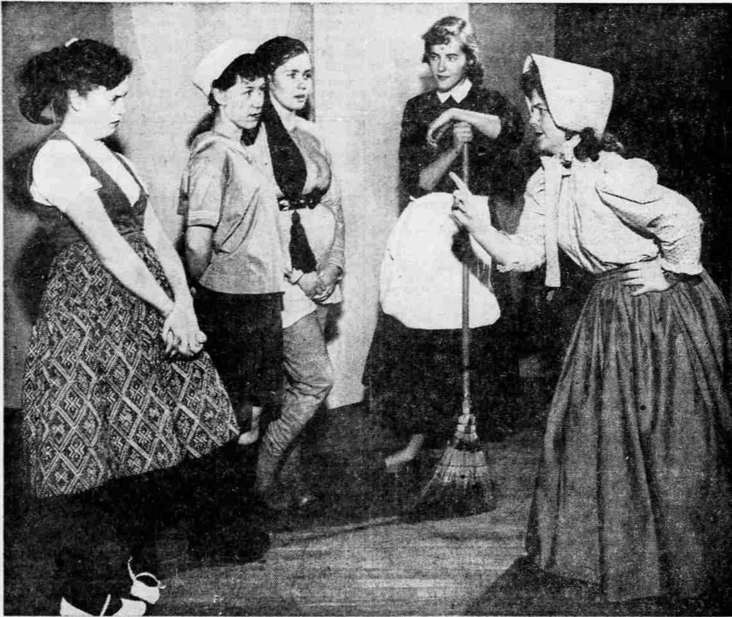
Five Medford Senior High school students are shown here in the roles they will play in a production of Victor Herbert's "Babes in Toyland." The operetta will be given Friday and Saturday, April 6-7, in the school auditorium, with curtain time at 8 p.m. Pictured (left to right) are Miss