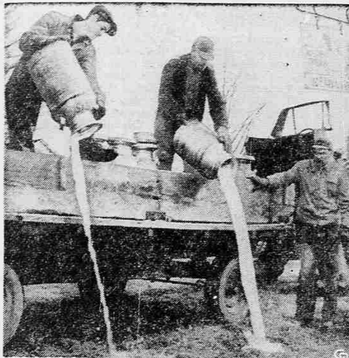
SEEKING HIGHER PRICES, workers of Kuhlman farm, near Armada, Mich., are dumping milk rather than have it spoil during strike involving Detroit area.

There were about 375,000 public deposit mail boxes in the U.S. as of May 1955.