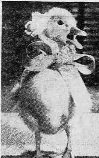
IN YOUR EASTER BONNET —The girls in the Easter parade will have nothing on Edith, a week old duckling at the Milwaukee Zoo. Edith is shown modeling her new, baby blue bonnet.