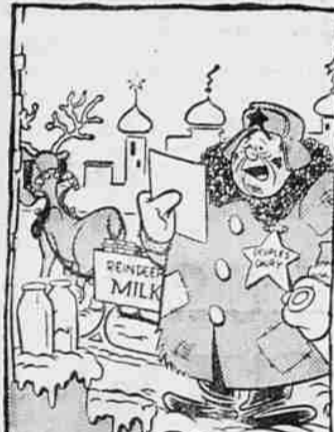
"Comrade Ivanovich must be dreaming again. Note says leave one bottle of OLD Mr. BOSTON VODKA."