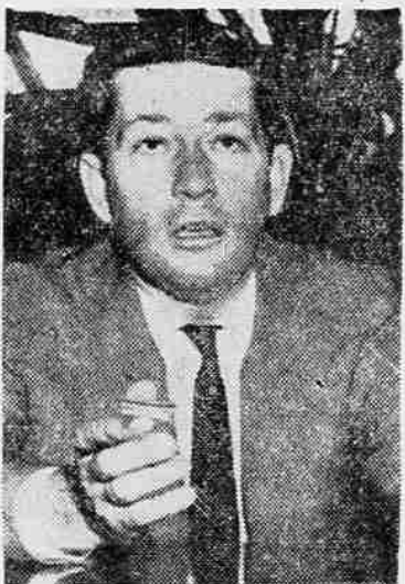
DAVIS CUP CAPTAIN —William F. Talbert talks with newsmen in New York after being named for the fourth year to captain the U. S. Davis Cup Team for 1956. Talbert expressed his confidence in the chances of the U. S. to regain the cup this year from Australia.